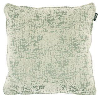
Flock green 45 x 45 cm