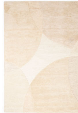
Neo 190 x 290 cm