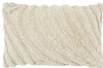
Sabi off-white 30 x 50 cm