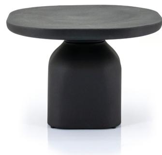
Squand coffee table large - black 60 x 60 x 41 cm

Where beige and earth tones currently dominate many interiors, we have not forgotten black. Besides the fact that you can easily blend black into your interior, it also has a nice weight to it. Ideal to create some balance in your interior. Black is here to stay.