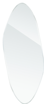
Gem 60 x 150 cm