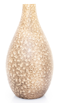
Era large ø 21 x 40 cm