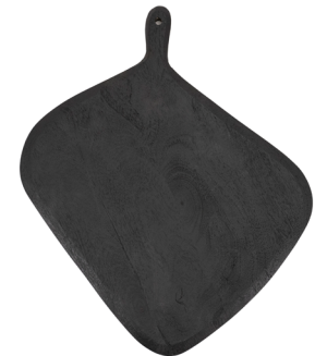
Manta large - black ●● 48 x 56 x 1.75 cm