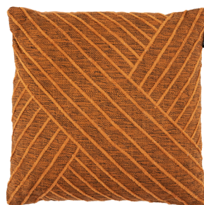
Obli orange 45 x 45 cm