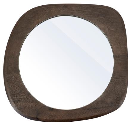
Moku large - brown 85 x 79 x 1.75 cm

Simplistic mirrors in organic shapes. Sometimes finished with a matching metal or wooden frame. A functional item that, in the right look and feel, is the ideal decoration to break up straight lines and create spaciousness.