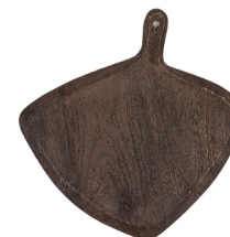
Manta small - brown ●● 37 x 38 x 1.75 cm