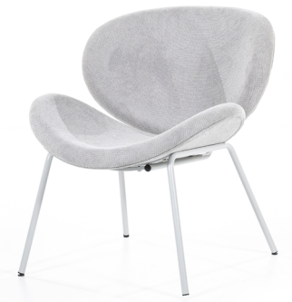
Ace grey 65 x 72 x 74 cm, seat height 40 cm