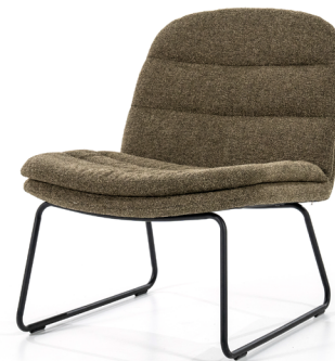
Bermo green 66 x 74 x 78 cm, seat height 42 cm