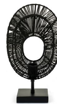
Ovo tablelamp - black 22 x 13 x 39 cm