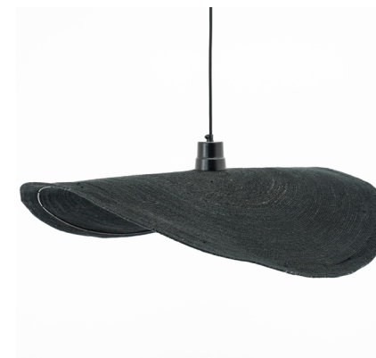
Sola large - black ø 97 cm, cordlength 200 cm

Lighting is essential in any interior. And in addition to functional lighting, it is perhaps even more important to create the right ambiance with ambient lighting. From pendant to floor lamp and from table lamp to wall lamp, the lighting of By-Boo puts your interior in the spotlight.