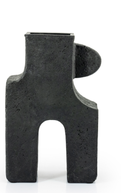
Tribe small - black 29.25 x 14 x 47 cm