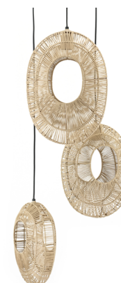
Ovo cluster round - natural ø 50 cm, cordlength 220 cm