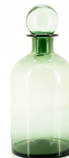
Dio large - green ø 17 x 40 cm