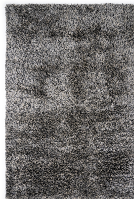
Dolce black 160 x 230 cm ● ● ●