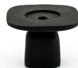
Squand small - black 14.2 x 14.2 x 9.7 cm