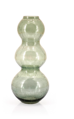
Viva large - green ø 21 x 42 cm