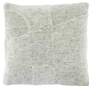
Yuka light grey 50 x 50 cm