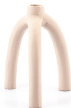
Twig small - off-white 13.5 x 13.5 x 16.5 cm