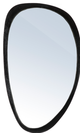
Plecto black 120 x 5 x 70 cm