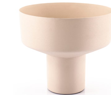
Buck large - off-white ø 20.5 x 18.5 cm