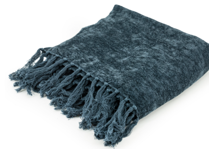
Envy dark blue 130 x 170 cm