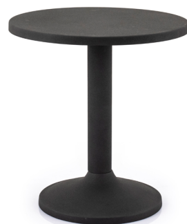
Dash small - black ø 40,5 x 60 cm