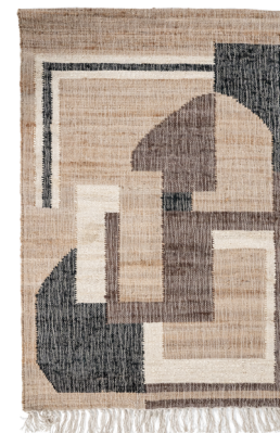
Aku large 130 x 180 cm