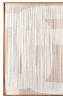
Yoko small - off-white 60 x 90 cm