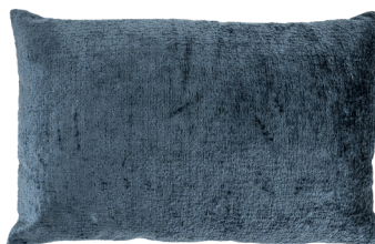
Saintz dark blue 40 x 60 cm