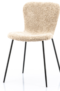
Skip beige 54 x 46 x 80 cm, seat height 45 cm