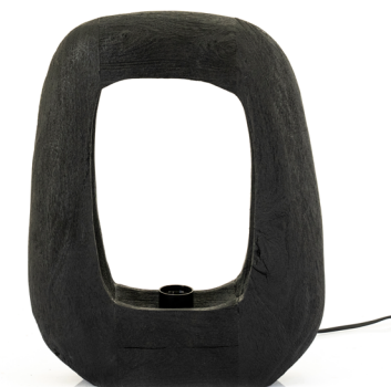
Gibs large - black 33 x 10 x 40 cm