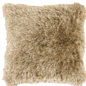
Fuse beige 50 x 50 cm