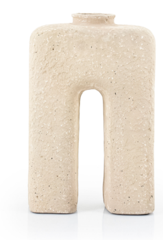
Arc large - natural 23 x 12 x 38 cm