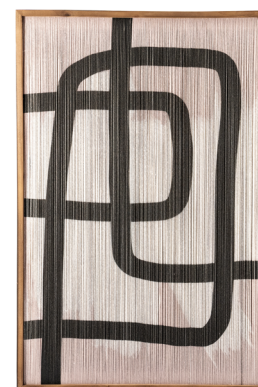
Yoko large - black 80 x 120 cm