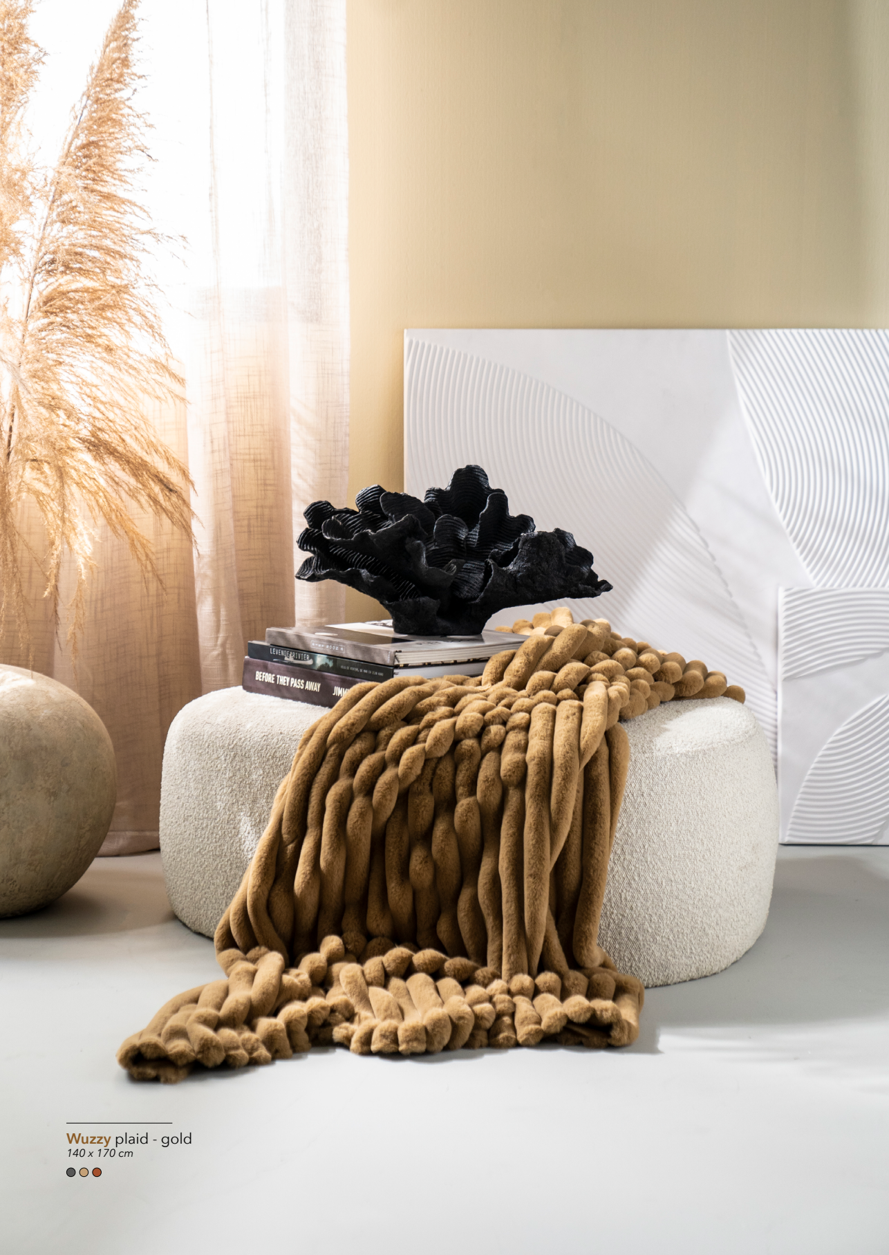
Wuzzy plaid - gold 140 x 170 cm