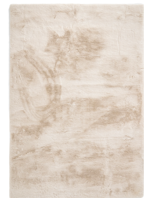
Zena beige 160 x 230 cm ● ● ●