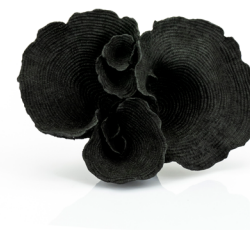
Agari black 33 x 14 x 22 cm