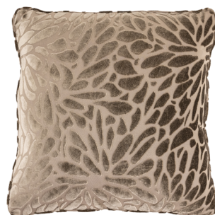
Saison brown 45 x 45 cm