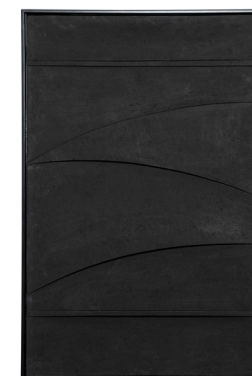
Ven large - black 61 x 90 cm