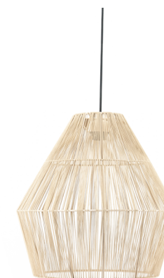
Aya 2 - natural ø 34 x 52 cm, cordlength 130 cm