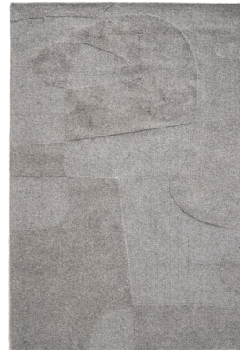
Yuka grey 160 x 230 cm ● ● ●