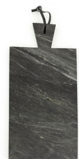
CB1 black ○●● 20 x 43 x 1 cm