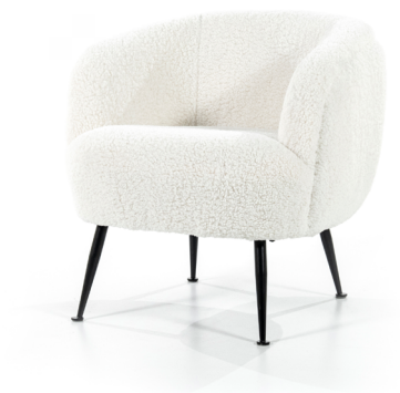
Babe white 74 x 72 x 71 cm, seat height 48 cm

Relaxation for every interior. The airy lounge chairs by By-Boo fit into any interior because of their slim design; without compromising on comfort. The 2022 collection of lounge chairs is inspired by trends with organic shapes and earth tones.