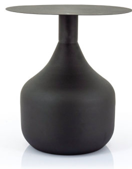
Mist black ø 40 x 45 cm