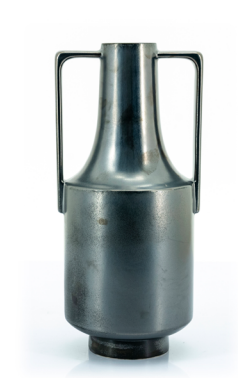
Jarra large 20 x 18 x 42 cm