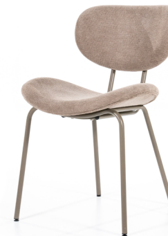
Ace brown 50 x 61 x 80 cm, seat height 48 cm