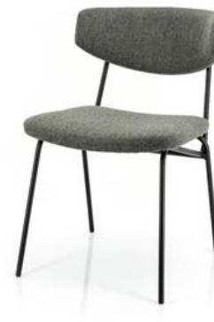
Crockett dark grey 49 x 59 x 77.5 cm, seat height 47 cm