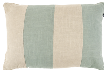
Blend natural green 40 x 60 cm