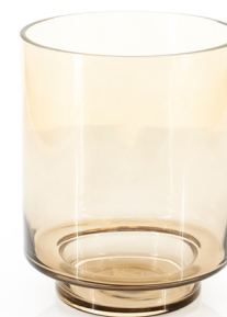
Hurly brown ø 20 x 25 cm