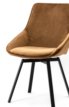
Beau ochre 51 x 59 x 87 cm, seat height 48 cm