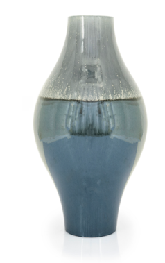
Gliss large ø 26 x 50 cm