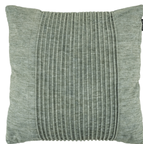
Lineas green 45 x 45 cm