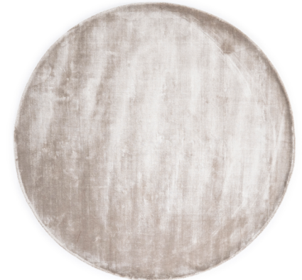
Muze round - grey ø 200 cm ● ● ●