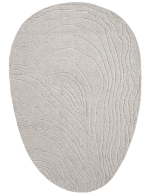
Pebble light grey 190 x 290 cm ● ● ●