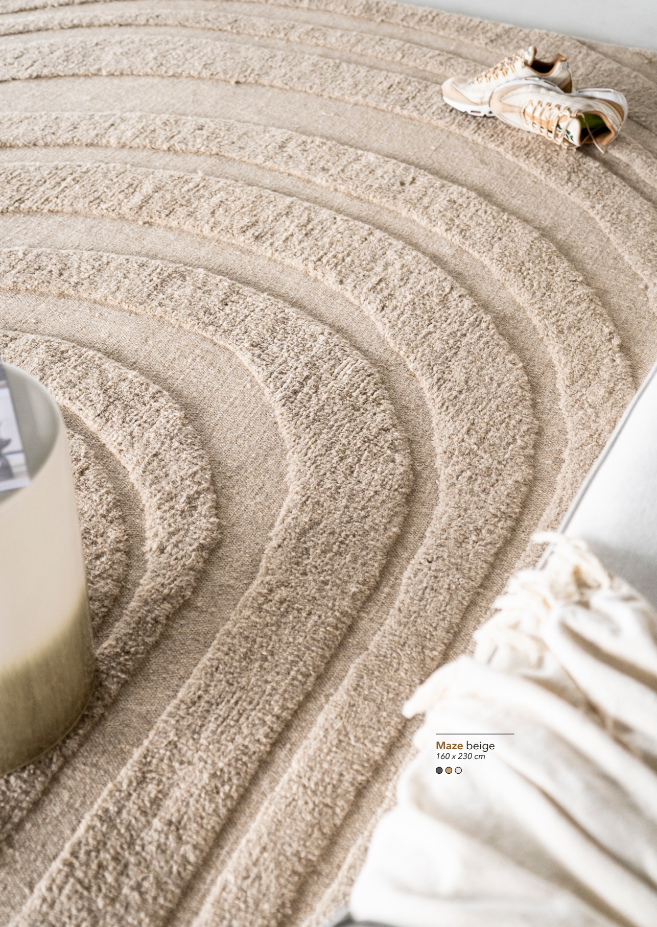
Maze beige 160 x 230 cm ● ● ●