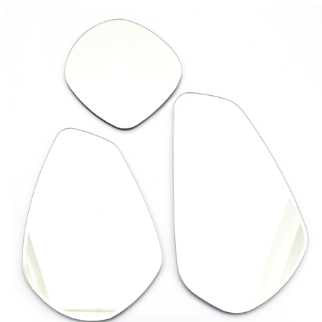
Trinity 40 x 40 cm/40 x 55 cm/40 x 65 cm