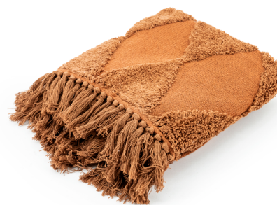
Wabi plaid - brown 140 x 170 cm