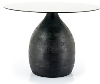
Bond coffee table - black ø 60 x 42 cm