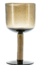
Bubble wine glass - brown ●● ø 8 x 15.5 cm