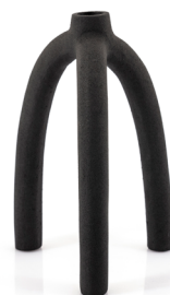
Twigg large - black 13.5 x 13.5 x 16.5 cm