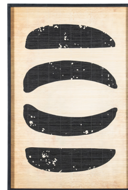
Kyoto large 80 x 120 cm