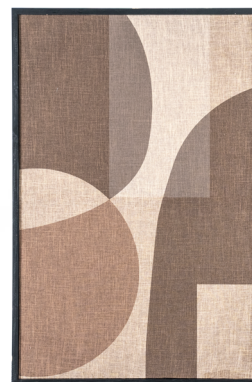
Ato large - brown 80 x 120 cm