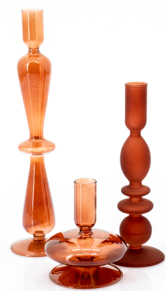
Aurora brick (set of 3) 7.5 x 31 cm | 7.5 x 23 cm | 8.5 x 12 cm