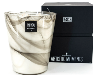
Artistic moments 120h ø 17 x 20 cm