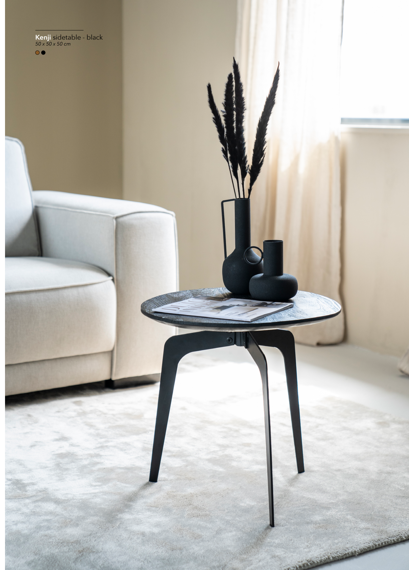
Kenji sidetable - black 50 x 50 x 50 cm