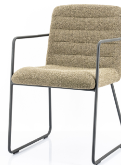
Artego green 53 x 60 x 83 cm, seat height 49.5 cm