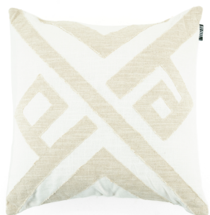
Kuna off-white 50 x 50 cm