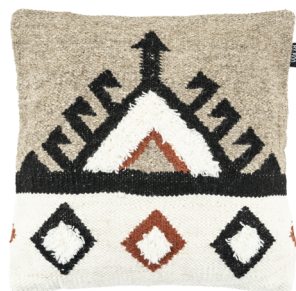
Aika 45 x 45 cm