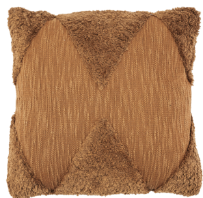
Wabi brown 45 x 45 cm